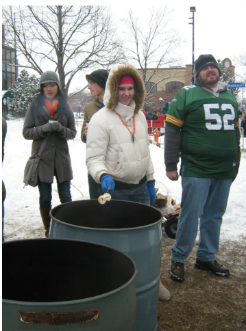
A Festival goer roasts a S'more over the fire at Winterfest.

Saints of God, come to their aid, come to greet them angels of the Lord. Receive their souls and present them to God. Present their souls to God Most High. Amen.