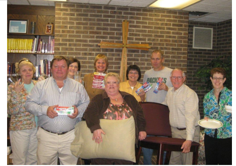
Pictured here are some of the twenty-one members of the Home Sweet Home Team at Ascension Lutheran.

The Home Sweet Home ministry exemplifies our belief that many times HOW something is given to others can be just as important or have even more impact on a person's life that WHAT is given. Thank you Home