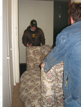
Home Sweet Home crew delivers a beautiful couch as part of the housewarming package.

help them to turn their house into a home. Not only does the group provide new and gently used items that aren't usually available at local thrift stores; such as shower curtains, garbage cans, pots and pans, mops, brooms and dust pans; they also go above and beyond to